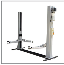
2 Post Lifts: